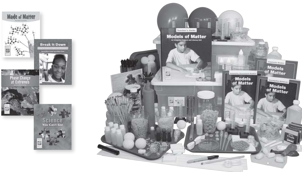
Models of Matter Science and Literacy Kit

To learn more about Seeds of Science/Roots of Reading ® products, pricing, and purchasing information, visit www.deltaeducation.com